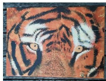
10 year old student