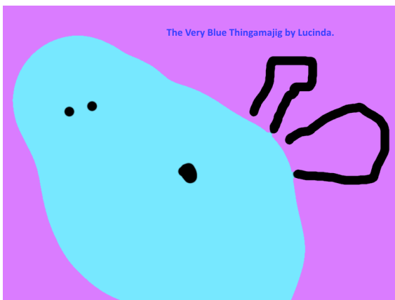
The Very Blue Thingamajig By Lucinda