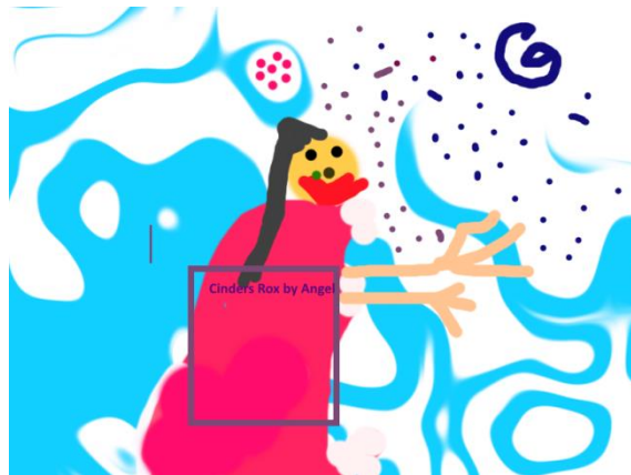
Cinders Rox ("Cinders Rox") by Angel