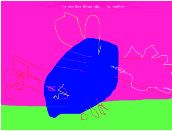
"The Very Blue Thingamajig" By Nandhini