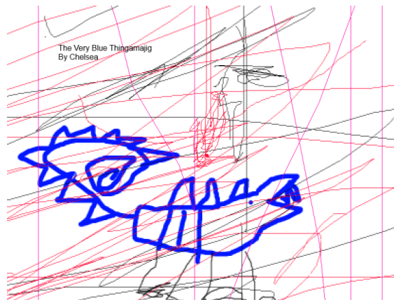
The Very Blue Thingamajig By Chelsea