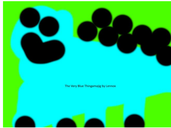
"The Very Blue Thingamajig" By Lennox